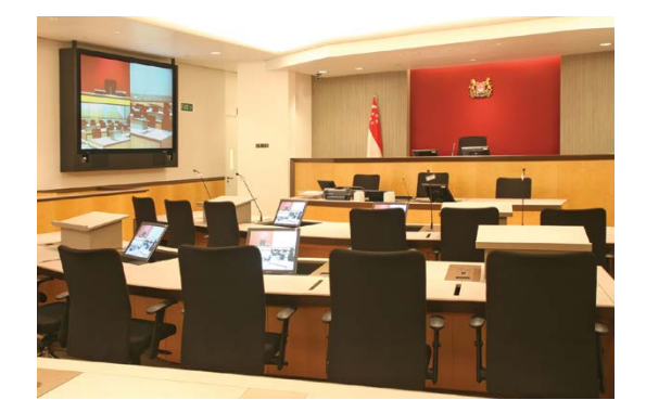
One of the courtrooms in the Supreme Court of Singapore.