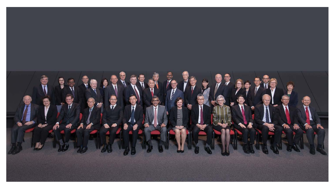
The bench of the Singapore International Commercial Court.