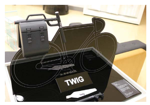
The Twig 3-in-1 convertible seat post, mudguard, saddle bag and back light designed and exhibited by Nanyang Polytechnic School of Design students.

Currently, the RDA provides a 6-month grace period from public disclosure for a few narrow situations. For example, if the design was displayed at one of a few recognised international exhibitions, it can still be registered if the application is filed within 6 months from the date of the opening of the exhibition.