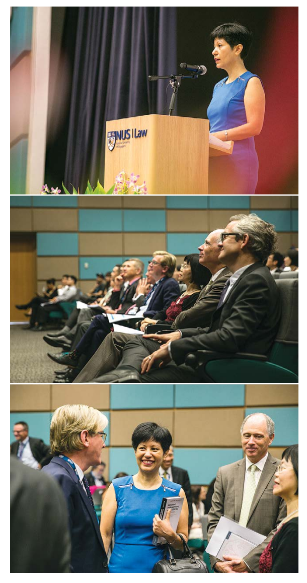
The Opening Session of the Design Law Reform Conference.

a) With the broadened scope of protection, design applicants may need guidance on how to register new types of designs and secure optimal protection for their designs.