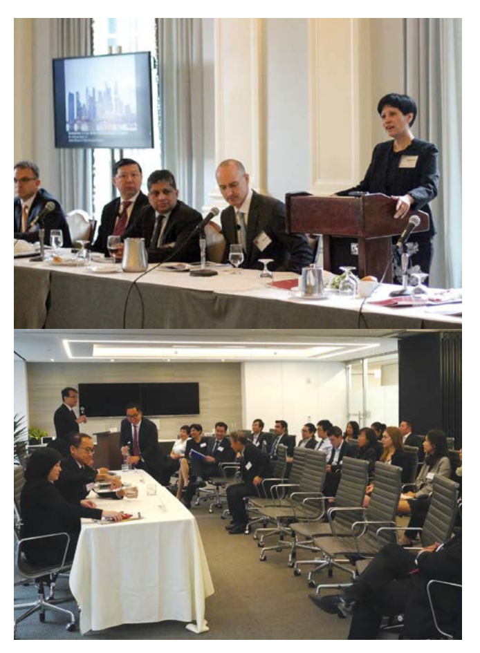
Roundtable organised by Milbank, Tweed, Hadley & McCloy LLP and GIC event on Singapore's enhanced debt restructuring regime.

Common law. In addition to national legislation, the common law provides a further avenue for recognition of insolvency proceedings. Courts recognise the desirability and practicality of a universal collection and distribution of assets in a single main proceeding, and offer assistance to achieve this.