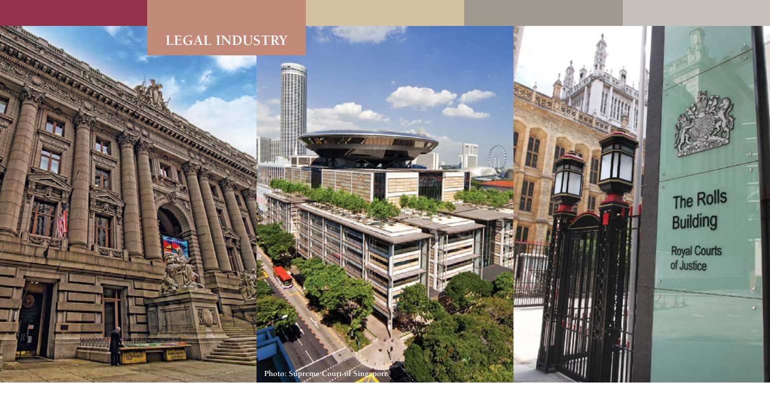
From left, United States Bankruptcy Court for the Southern District of New York, Supreme Court of Singapore, The High Court of England and Wales at the Rolls Building.