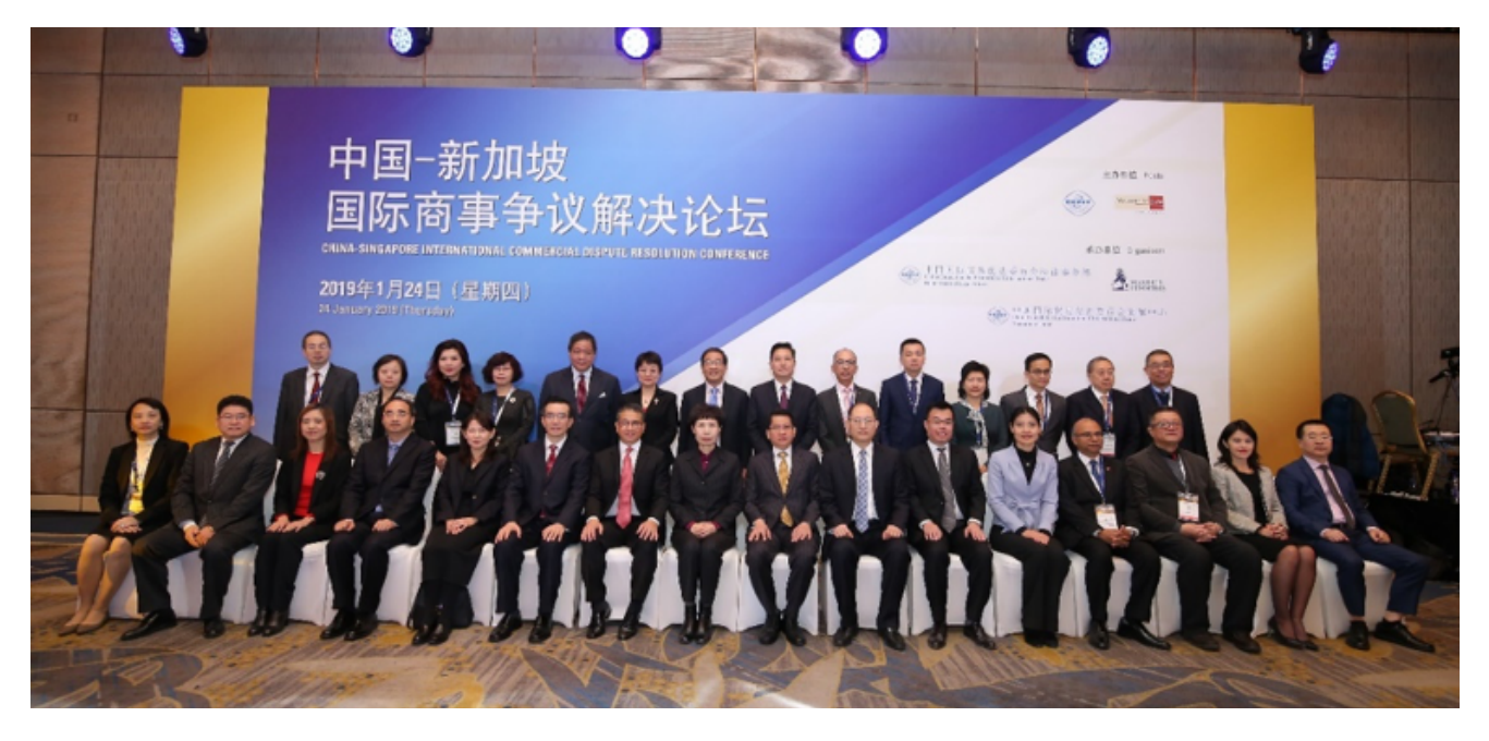
Inaugural China-Singapore International Commercial Dispute Resolution Conference in Beijing in January 2019

We actively market and promote our legal and dispute resolution services overseas, to seek out opportunities for our institutions and law firms to engage potential users; we push for access for our law firms and lawyers in key markets; and we strengthen legal cooperation at government-to-government, institution-to-institution, and people-to-people level