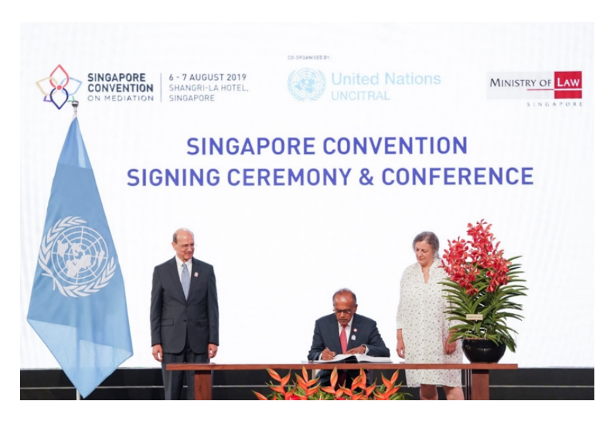
Minister Shanmugam signing the Singapore Convention on Mediation on behalf of Singapore

On 7 August 2019, when the Convention was opened for signature, 46 countries signed and another 24 countries attended to show support. Signatories included the two largest economies in the world - the US and China; three of the four largest economies in Asia - China, India and South Korea; and five of the ten ASEAN members - Brunei, Laos, Malaysia, Philippines and Singapore. Since then, six other countries signed the Singapore Convention, bringing the number of signatories to 52.