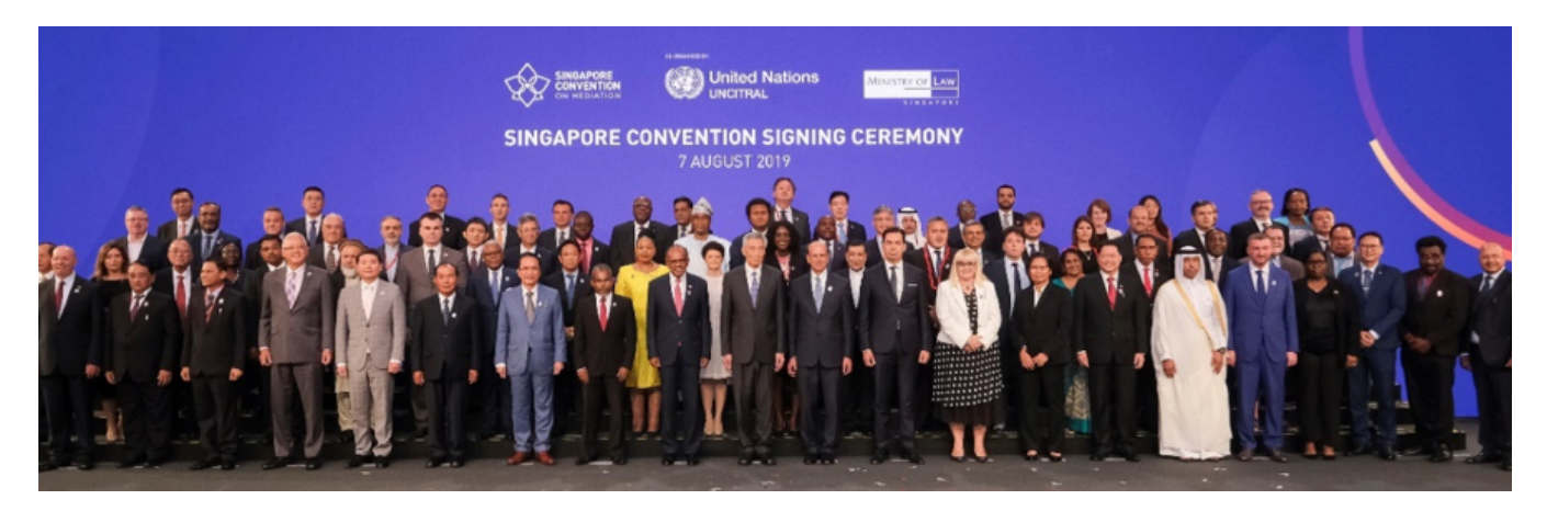
Group photo of the 70 countries who attended the Singapore Convention Signing Ceremony and Conference on 7 August 2019

I cannot look back on 2019 without mentioning the Singapore Convention on Mediation. It was a historic occasion, not just for MinLaw, but for Singapore. It was the first time that a United Nations (UN) Convention was named after Singapore – a special honour.