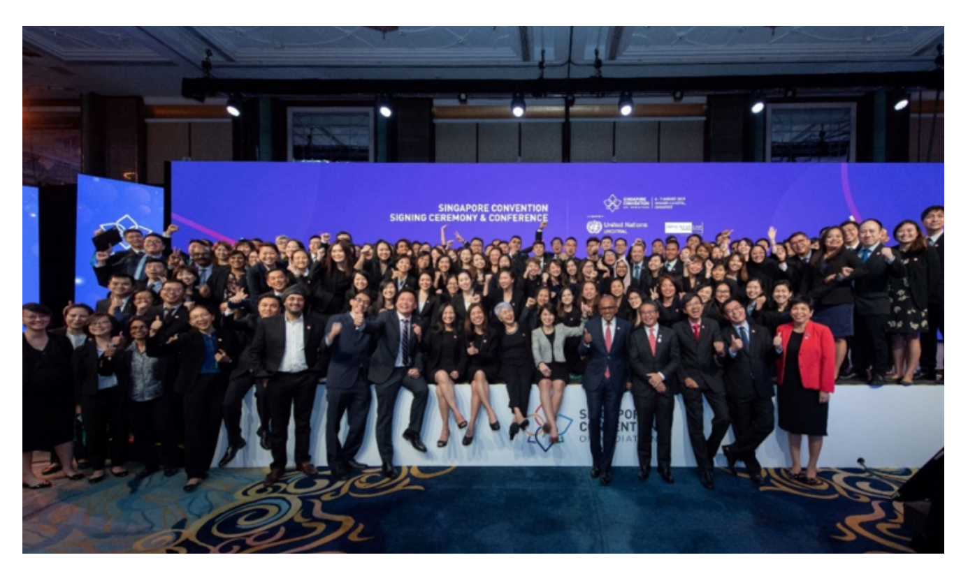
MinLaw team who made the Singapore Convention on Mediation possible!

During the Singapore Convention Week, we also saw the grand opening of Maxwell Chambers Suites; the official launch of INSOL Asia Hub; and the official launch of American Arbitration