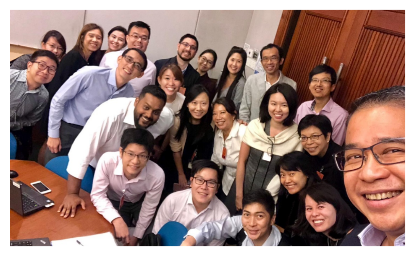
Wefie with MinLaw officers at COS 2019

By Edwin Tong, SC, Senior Minister of State for Law and Health